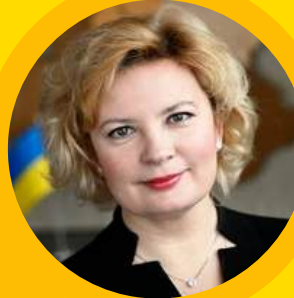
Olga Dibrova Embassador of Ukraine to Finland (Ukraine)