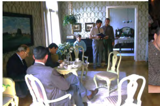
Invitations to forest owner's homes