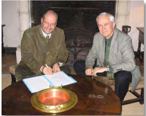
2006 ONF – Metsähallitus agreement, Orleans