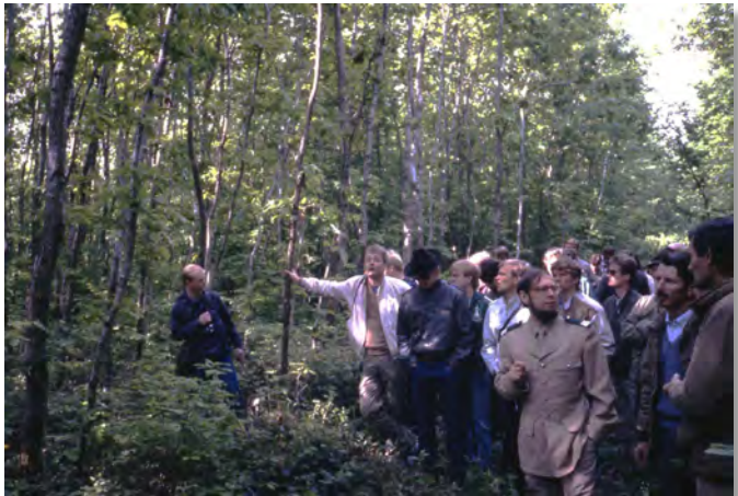
1984 Forestry students, Dijon