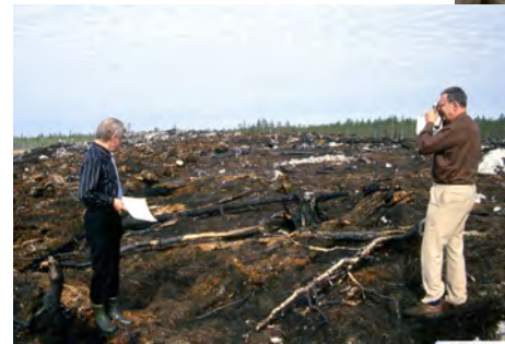
Controlled burning for forest regeneration