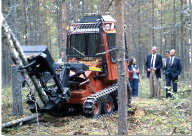
1982 Working group meeting, Lieksa