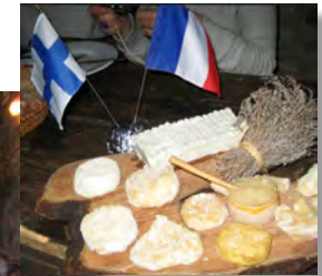
Delicious meals, wine, cheese