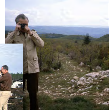
Forest fire catastrophes